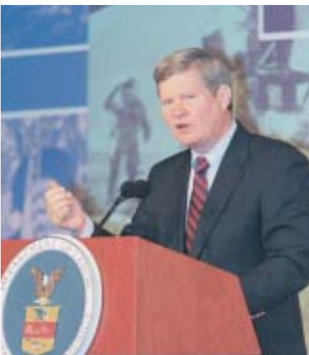
Senator Tim Johnson