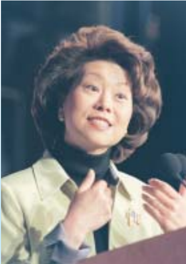
Secretary of Labor Elaine L. Chao