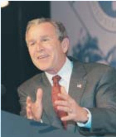
President George W. Bush

The President also noted the importance of personal retirement accounts in which workers could voluntarily invest part of their Social Security taxes directly in the market. "Someone retiring today after 45 years of work would be entitled to a monthly benefit of $1,128 from Social Security. If those Social Security taxes had been invested in the stock market during the same period of time, that person would now have . . . income of more than $3,700 a month," he said. Personal retirement accounts would give older Americans "access not just to a monthly check, but to personal wealth."