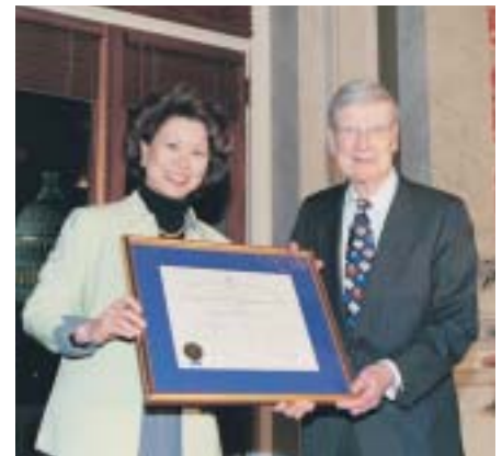
Secretary Chao honors Senator William Roth

At the Congressional breakfast on the second day of the Summit, Senators Arlen Specter and Tim Johnson joined Representatives Earl Pomeroy and Sam Johnson to offer a variety of perspectives on retirement savings.