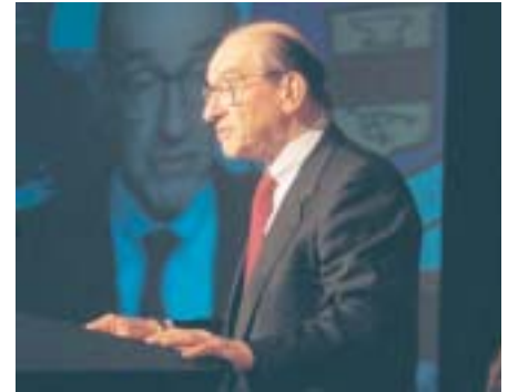
Federal Reserve Chairman Alan Greenspan

The Senator said he would introduce legislation that would protect workers in 401(k) plans against employer pressure to buy company