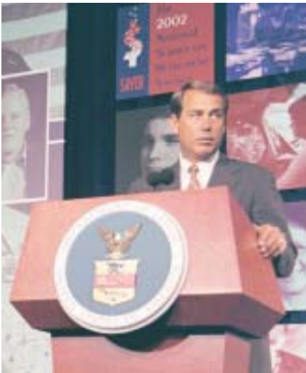
Representative John Boehner

"I see two great challenges," said Portman. First, employee education is "the next great frontier" of pension reform. Second, "post-Enron, we have to make sure that folks out there believe their retirement accounts are secure." This requires allowing people to diversify out of company stock and improving company information and disclosure, as envisioned in President Bush's proposal.