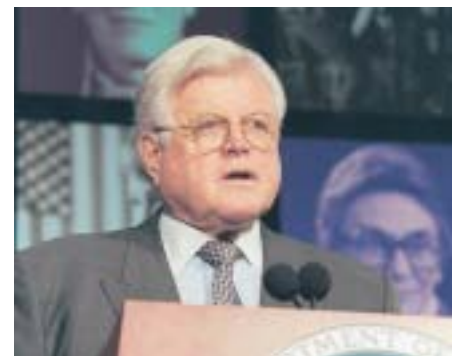
Senator Edward Kennedy