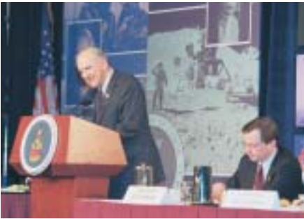
Representative Sam Johnson and Representative Earl Pomeroy

Senator Tim Johnson, the final breakfast speaker, chairs the Senate’s Financial Institutions Subcommittee. Along with colleagues on the Banking Committee, Johnson has co-sponsored the Safe and Fair Deposit Insurance Act of 2002 (the Safety Act), which proposes that FDIC coverage be extended from its current limit of $100,000 to $250,000 in the case of retirement accounts. “We ought to allow people to put it into hometown banks and keep that money turning over in their local community, while at the same time giving themselves an insured safe haven for their money,” he argued.